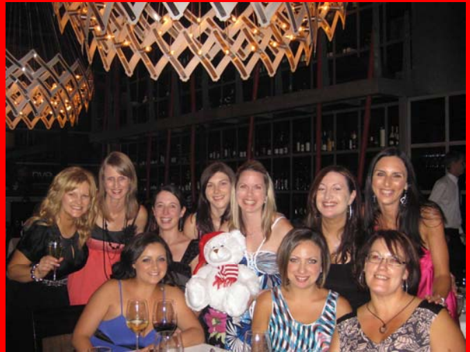
Part of the team enjoying the AA Christmas Party at Wildfire!

AA wishes you all a wonderful Christmas and a prosperous 2010!