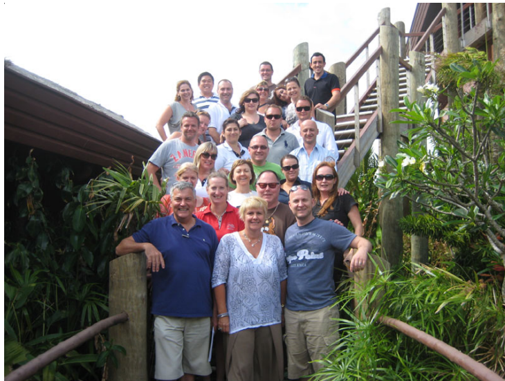
ABOVE: The Concorde Agency Network's Air Tickets team recently travelled to Fiji to set out their strategy for 2010.

They are pictured here at the Outrigger on the Lagoon, Fiji.