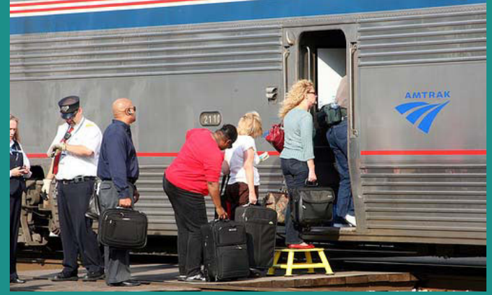
*Itinerary subject to change.

Full terms and conditions available at www.traveldaily.com.au.