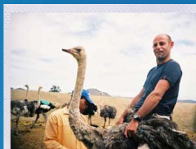
Riding an Ostrich in South Africa

To enter, simply send in a caption that represents the adventure photo featured above. You can enter as many times as you want.