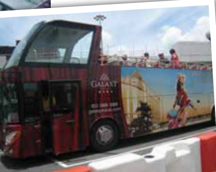
Open Top Bus

1865-built lighthouse and tiny chapel - FREE of charge.