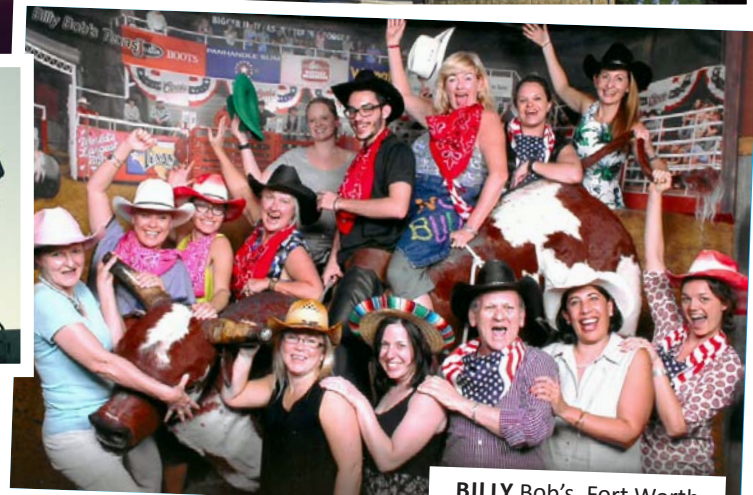
BILLY Bob's, Fort Worth.