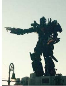
UNIVERSAL Orlando Resort was more than meets the eye!