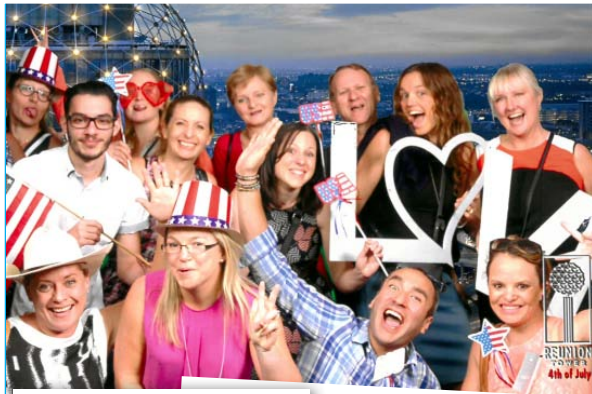
DALLAS Reunion Tower.

A trip to the Fort Worth Stockyards and National Historic District was highlighted by the Fort Worth Herd Cattle Drive and meeting cowboys!