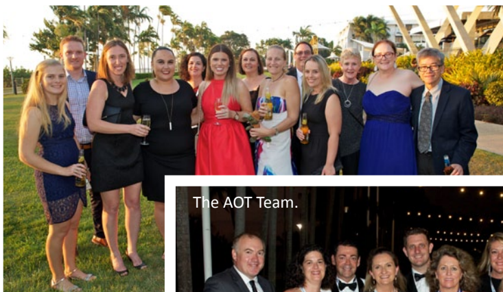
ABOVE: Crocodile Team.