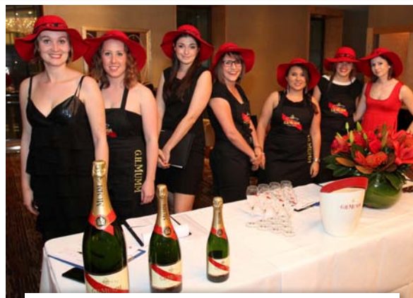
THE Atout France team love a glass of Mumm!