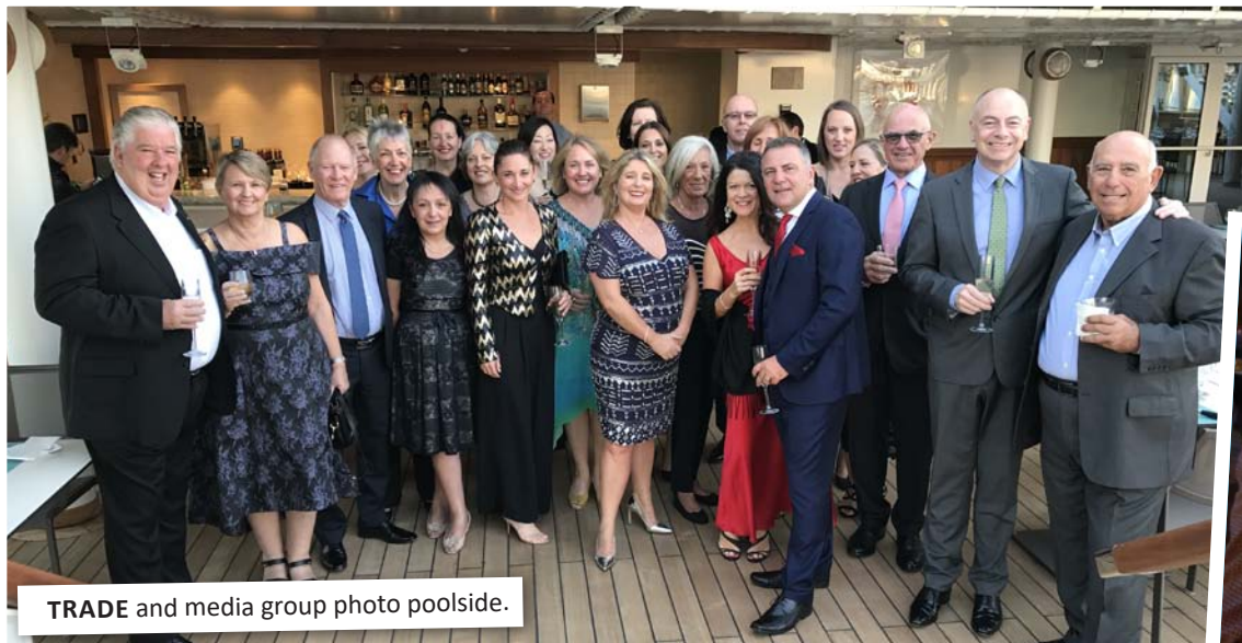
TRADE and media group photo poolside.