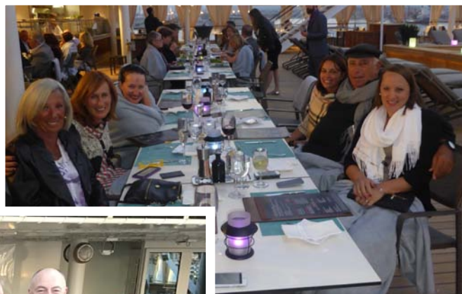
SILVER Muse Hot Rocks dining by the pool.

To see a video from the Silver Muse shakedown cruise, CLICK HERE .