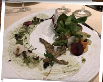
ATLANTIDE Garden Pot - Signature Dish of Culinary Director, Rudi Scholdis - a whopping 32 ingredients!!