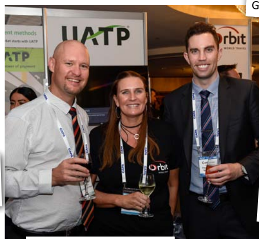
ATTENDEES enjoying the networking function.