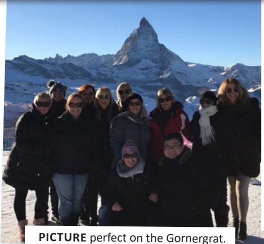
PICTURE perfect on the Gornergrat.