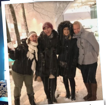
FUN in the snow after a lovely dinner at the Park Hyatt Zurich.