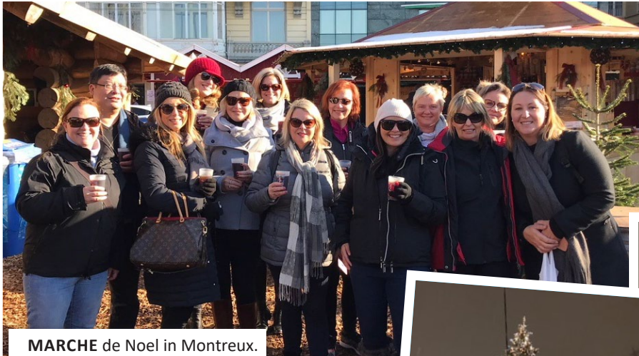
MARCHE de Noel in Montreux.