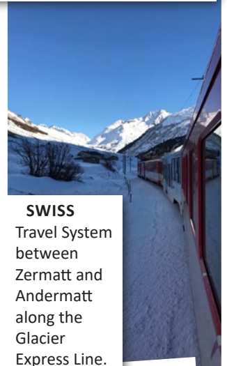
SWISS Travel System between Zermatt and Andermatt along the Glacier Express Line.