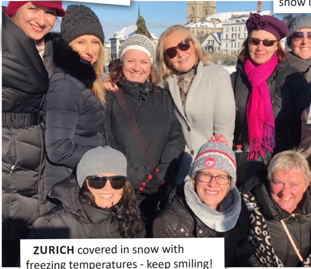
ZURICH covered in snow with freezing temperatures - keep smiling!