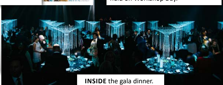
INSIDE the gala dinner.