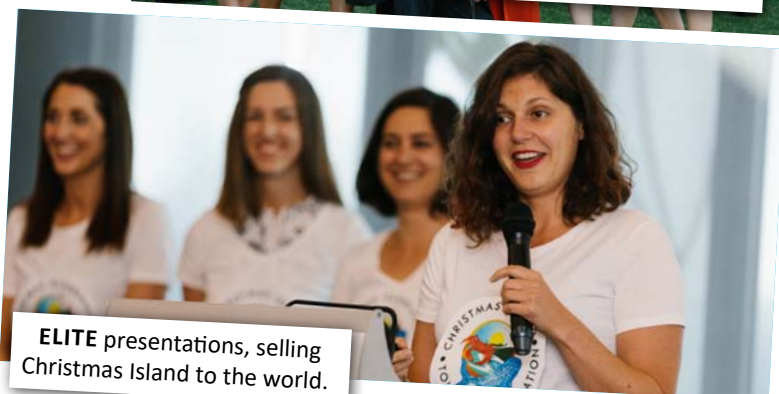
ELITE presentations, selling Christmas Island to the world.