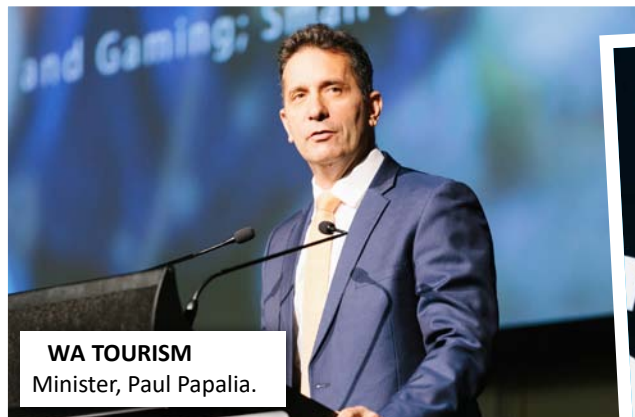
WA TOURISM Minister, Paul Papalia.