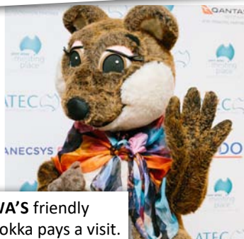
WA'S friendly Quokka pays a visit.