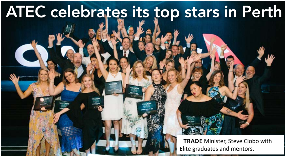
TRADE Minister, Steve Ciobo with Elite graduates and mentors.

"This growth is aligned with the growth we are seeing across the export tourism industry and with increasing numbers of tourism operators focused on gaining a share of this growing market opportunity, they are looking to ATEC as a professional industry group able to maximise this growth for their business," he said.