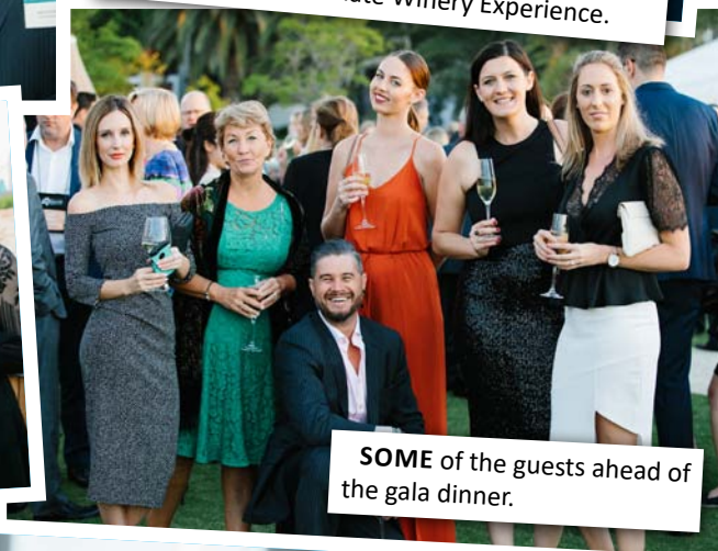
SOME of the guests ahead of the gala dinner.