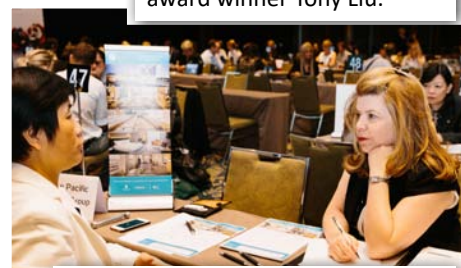
OVER 3,500 B2B meetings were held on Workshop Day.