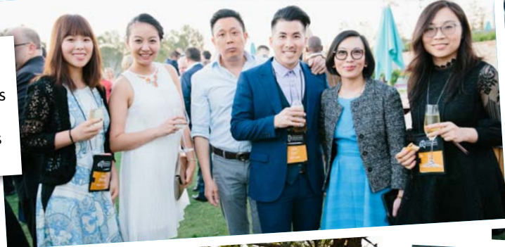
GUESTS gathering at Crown Towers Perth ahead of the night's gala dinner.