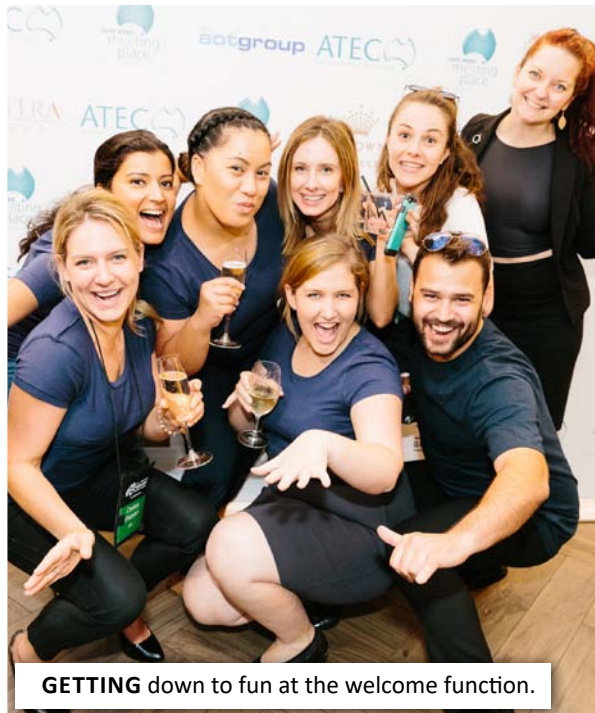
GETTING down to fun at the welcome function.