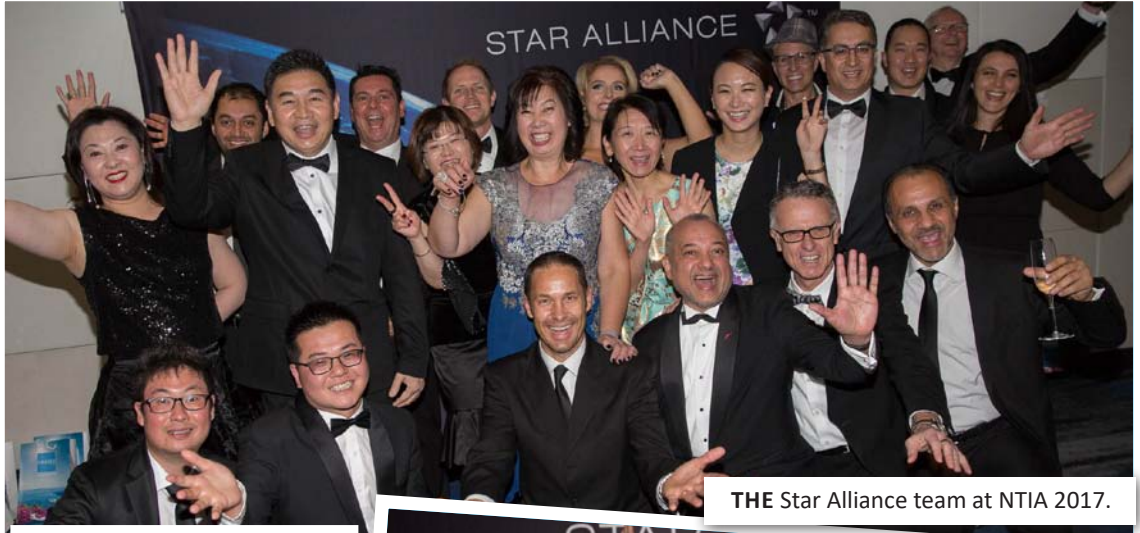
THE Star Alliance team at NTIA 2017.

For more information on Star Alliance in Australia go to www.staralliance.net.au .