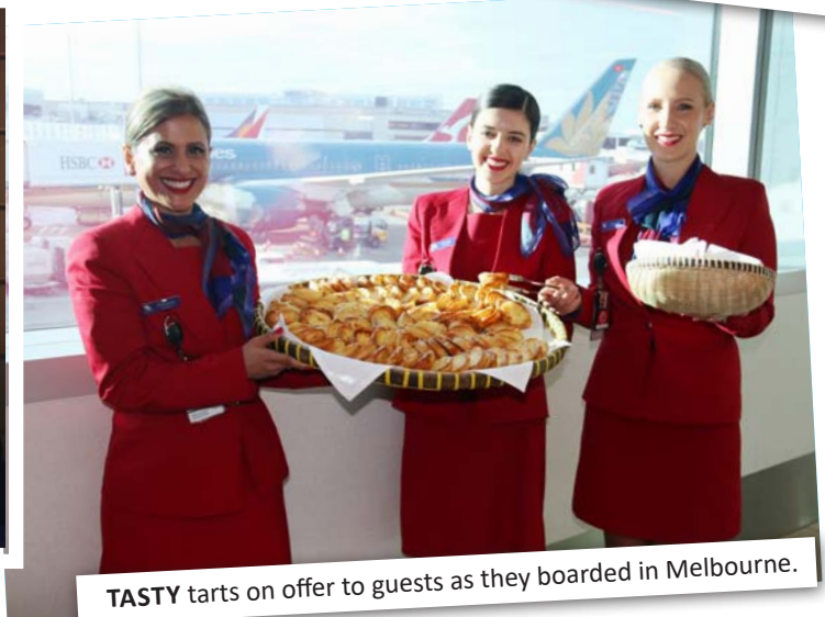
TASTY tarts on offer to guests as they boarded in Melbourne.