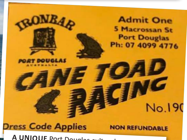
A UNIQUE Port Douglas cultural experience!