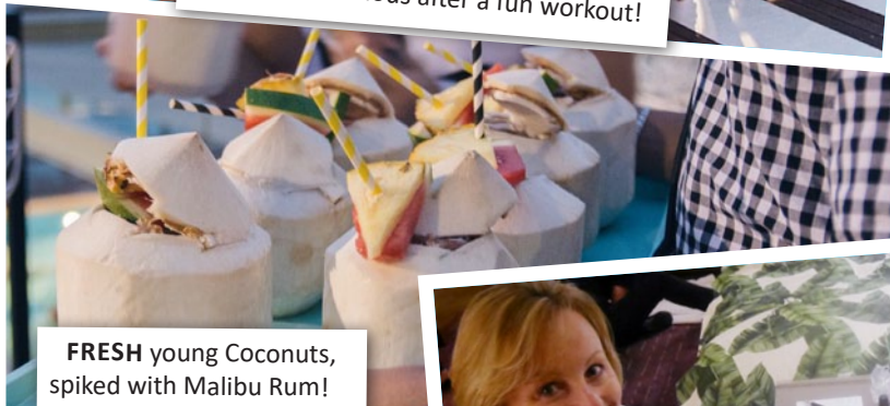
FRESH young Coconuts, spiked with Malibu Rum!