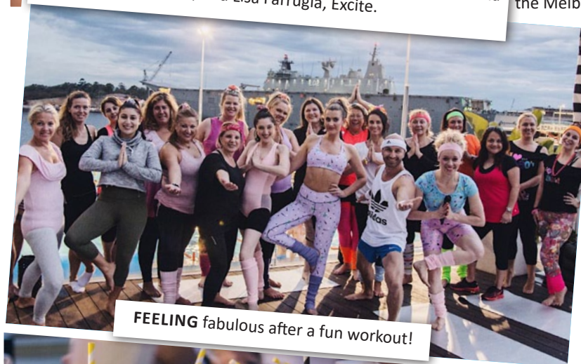
FEELING fabulous after a fun workout!