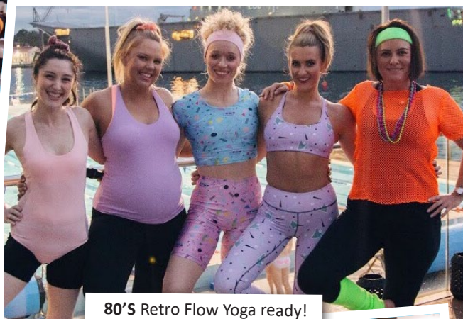
80'S Retro Flow Yoga ready!