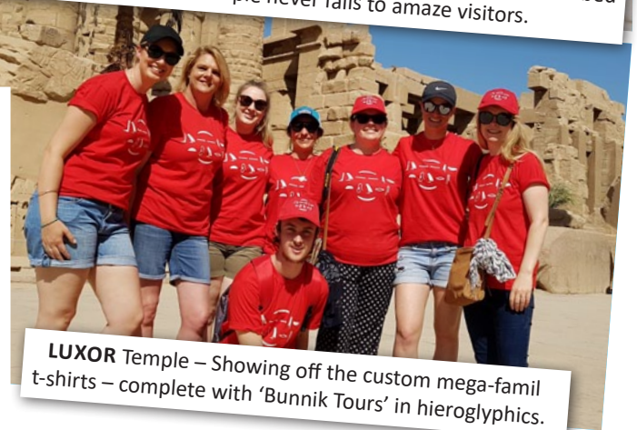
LUXOR Temple – Showing off the custom mega-famil t-shirts – complete with 'Bunnik Tours' in hieroglyphics.