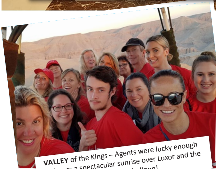
VALLEY of the Kings – Agents were lucky enough to witness a spectacular sunrise over Luxor and the Valley of the Kings by hot air balloon!