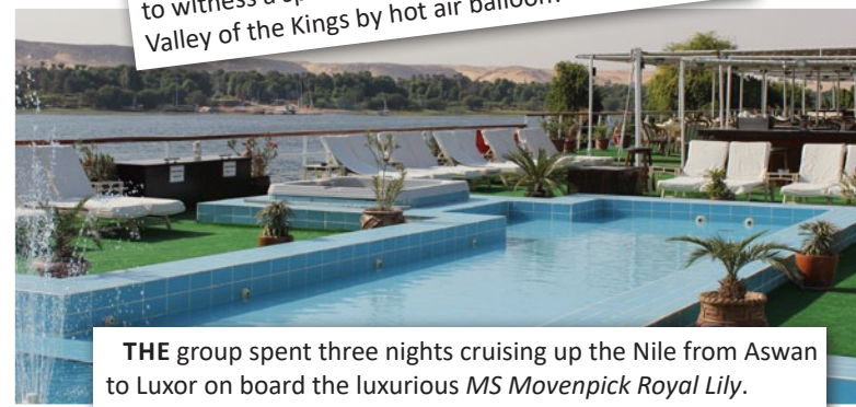
THE group spent three nights cruising up the Nile from Aswan to Luxor on board the luxurious MS Movenpick Royal Lily .