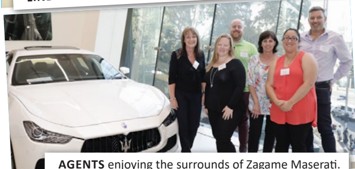
AGENTS enjoying the surrounds of Zagame Maserati.