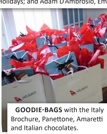
GOODIE-BAGS with the Italy Brochure, Panettone, Amaretti and Italian chocolates.