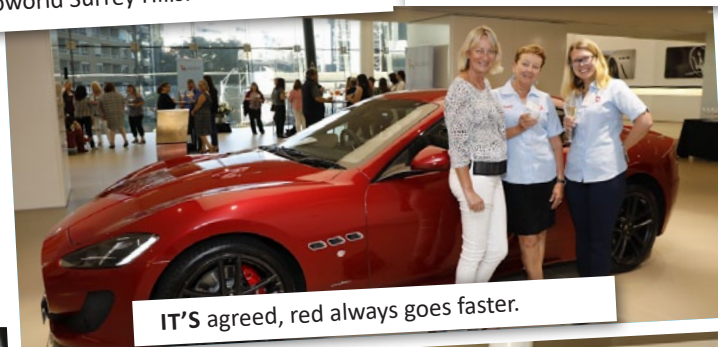
IT'S agreed, red always goes faster.