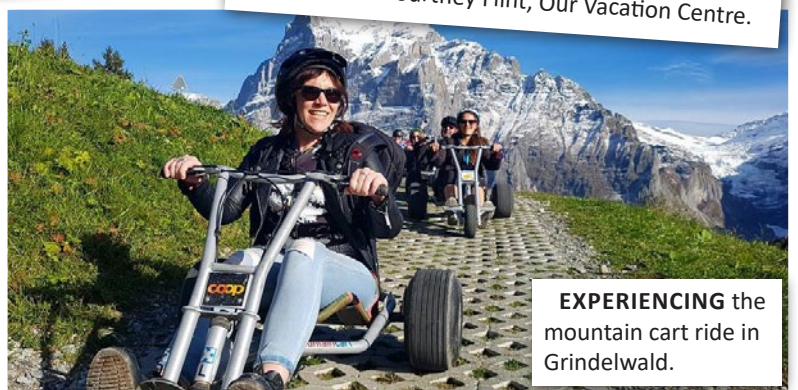
EXPERIENCING the mountain cart ride in Grindelwald.