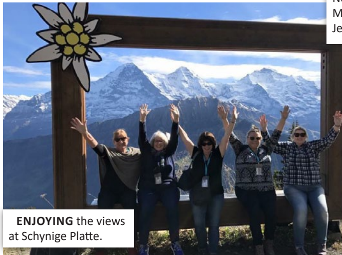
ENJOYING the views at Schynige Platte.