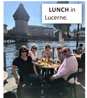
LUNCH in Lucerne.