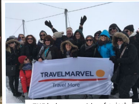
THE lucky group at Jungfrauoch.