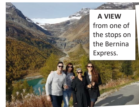
A VIEW from one of the stops on the Bernina Express.