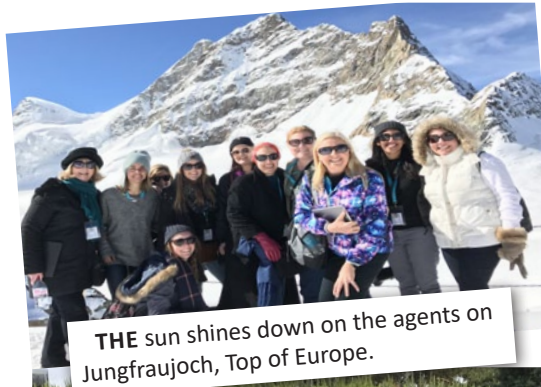
THE sun shines down on the agents on Jungfrauoch, Top of Europe.