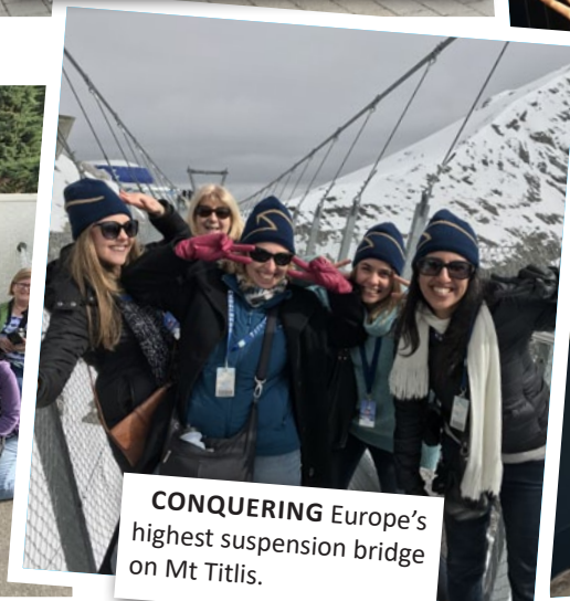
CONQUERING Europe's highest suspension bridge on Mt Titlis.