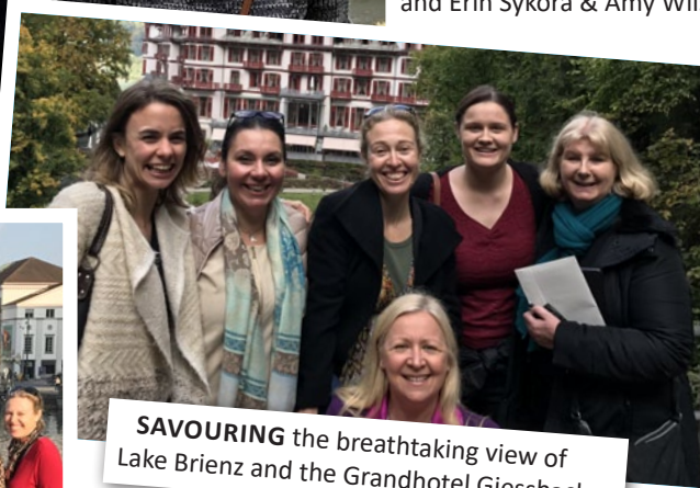
SAVOURING the breathtaking view of Lake Brienz and the Grandhotel Giessbach.