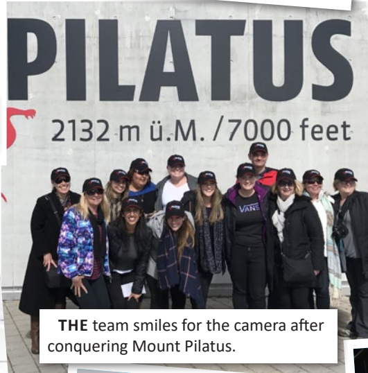
THE team smiles for the camera after conquering Mount Pilatus.