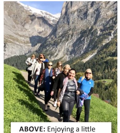
ABOVE: Enjoying a little stroll in Grindelwald. BELOW: Agents see the charming streets of Lausanne.