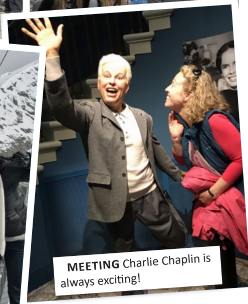
MEETING Charlie Chaplin is always exciting!