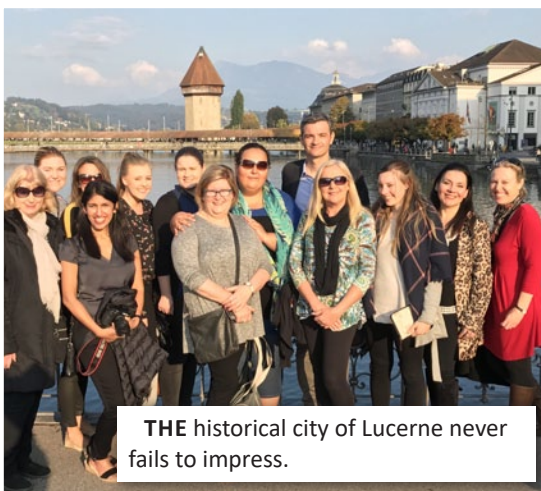
THE historical city of Lucerne never fails to impress.