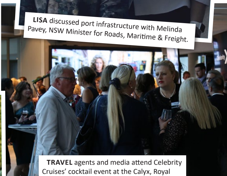
TRAVEL agents and media attend Celebrity Cruises' cocktail event at the Calyx, Royal Botanical Gardens in Sydney.