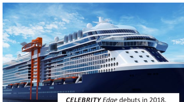
CELEBRITY Edge debuts in 2018.