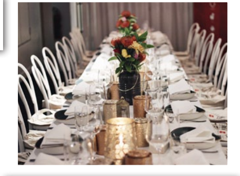
TABLE decorations were on point at Excite Holidays and Abu Dhabi Tourism's exclusive agent dinner.