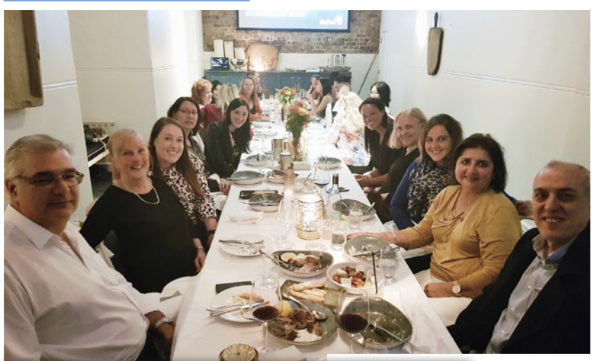
SYDNEY agents learnt about all things Abu Dhabi, followed by an exquisite feast!