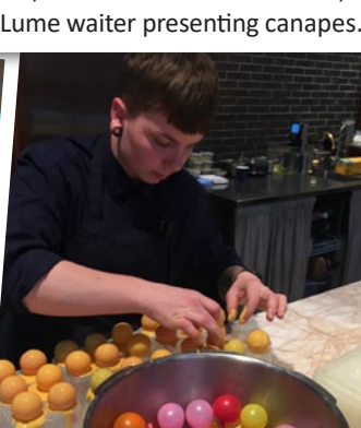
THE meticulous preparation of canapes for the Couture Collection launch event.