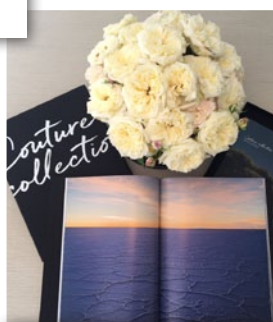
COUTURE Collection book.