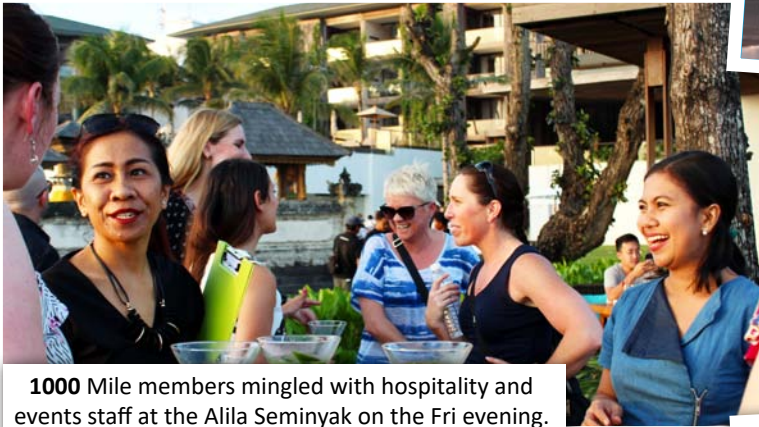
1000 Mile members mingled with hospitality and events staff at the Alila Seminyak on the Fri evening.