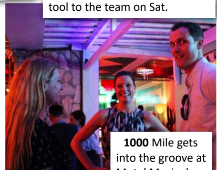
1000 Mile gets into the groove at Motel Mexicola.