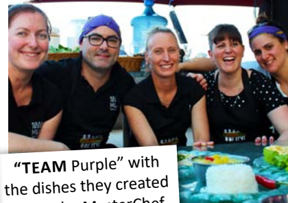
"TEAM Purple" with the dishes they created during the MasterChef challenge.