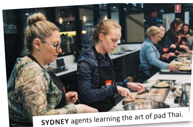
SYDNEY agents learning the art of pad Thai.