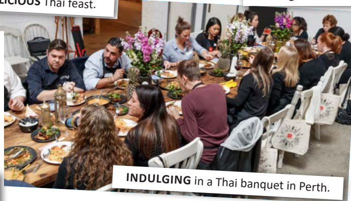
INDULGING in a Thai banquet in Perth.