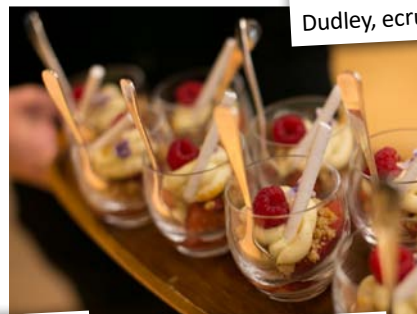
GUESTS were treated to these delicious desserts.