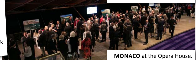
MONACO at the Opera House.