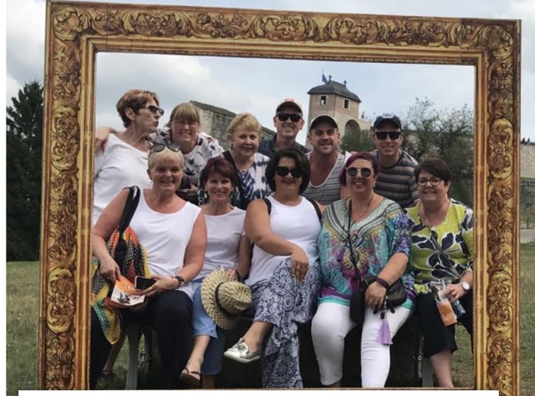
THE TravelManagers team strikes a pose in Besancon, along with some Back-Roads Touring passengers.

Voted the Best Small Coach Holiday provider in the 2015 and 2016 British Travel Awards, Back-Roads Touring specialises in small group touring across the UK and Europe. Offering a maximum group size of 18 on coach tours, and 20 on barge tours, Back-Roads explores the scenic back roads, with charming local accommodation and authentic local experiences. CLICK HERE for more details.