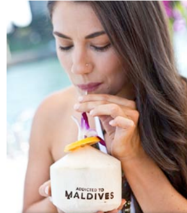
A MALDIVIAN welcome with fresh coconuts.