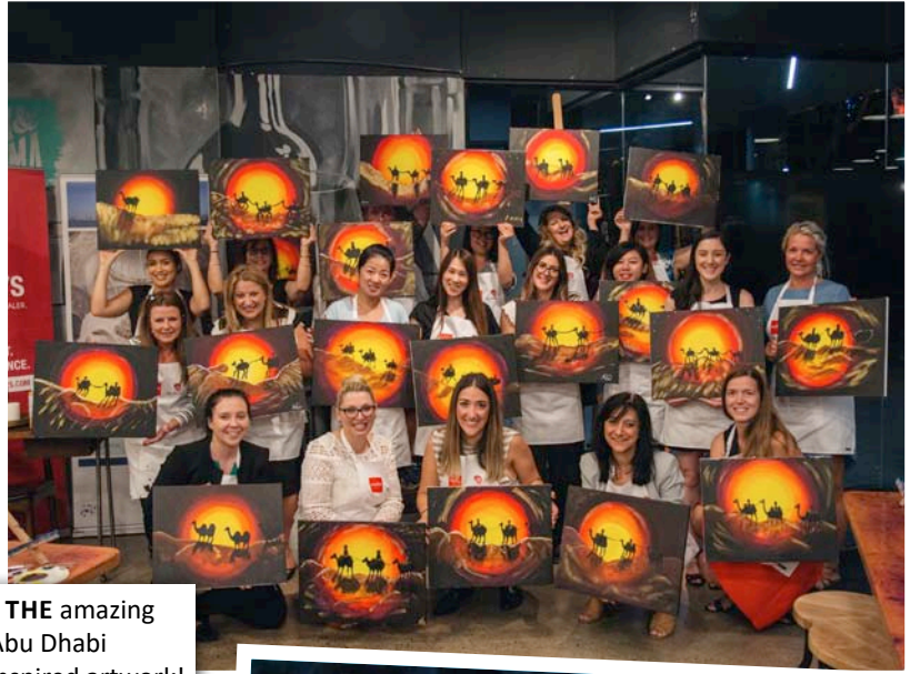
THE amazing Abu Dhabi inspired artwork!

The events were a huge success and showed agents why Abu Dhabi is deserving of a spot on the bucket list and how accessible the destination is for Australian travellers. From now until Sun 22 Apr, agents have the chance to win one of eight spots on an Abu Dhabi famil. Visit engage.exciteholidays.com/abudhabi for more information and to download the curated guide.