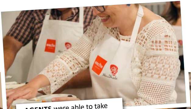
AGENTS were able to take home their custom aprons.