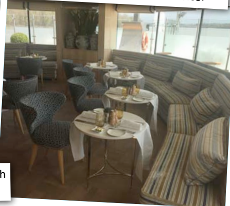
SCHUBERT'S cafe at the bow doubles as another dining option on Beatrice .