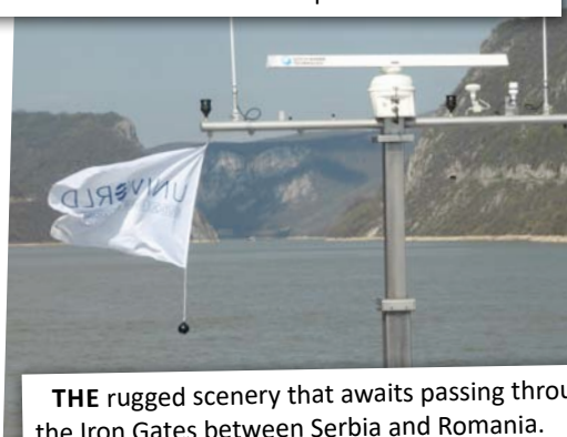
THE rugged scenery that awaits passing through the Iron Gates between Serbia and Romania.