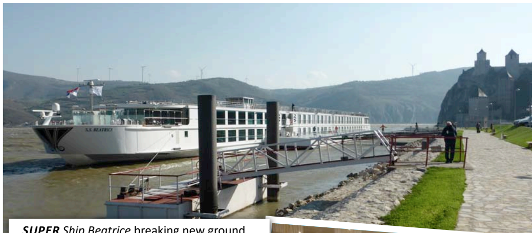
SUPER Ship Beatrice breaking new ground, becoming the first river cruise ship to dock at the Golubac Fortress facility in Serbia.

See Travel Daily's Facebook and Instagram feeds for lots of exclusive photos and videos.