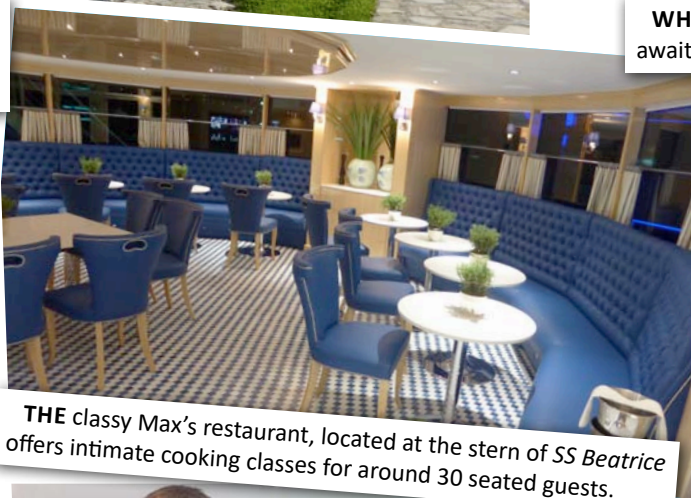
THE classy Max's restaurant, located at the stern of SS Beatrice offers intimate cooking classes for around 30 seated guests.