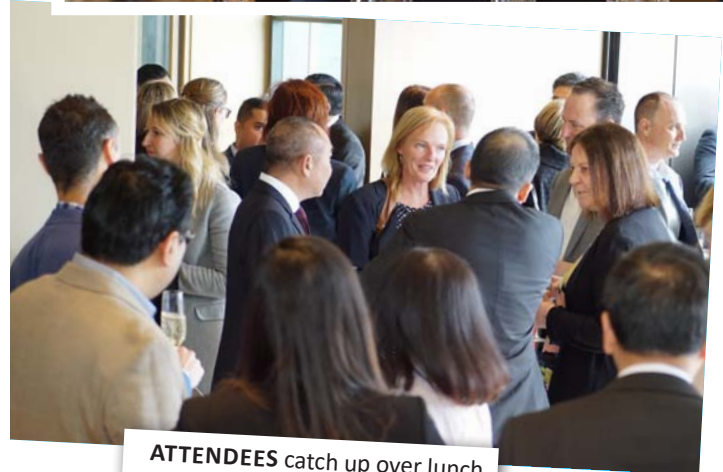
ATTENDEES catch up over lunch.