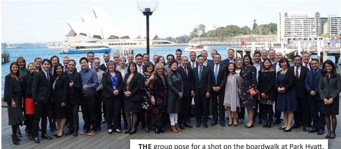
THE group pose for a shot on the boardwalk at Park Hyatt.