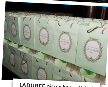
LADUREE picnic bags - YUM!