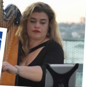
CLASSICAL music and opera singers provided a delightful background.