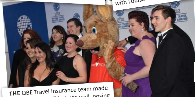
THE QBE Travel Insurance team made the most of the NTIA photo wall, posing above with a fluffy Qantas mascot.