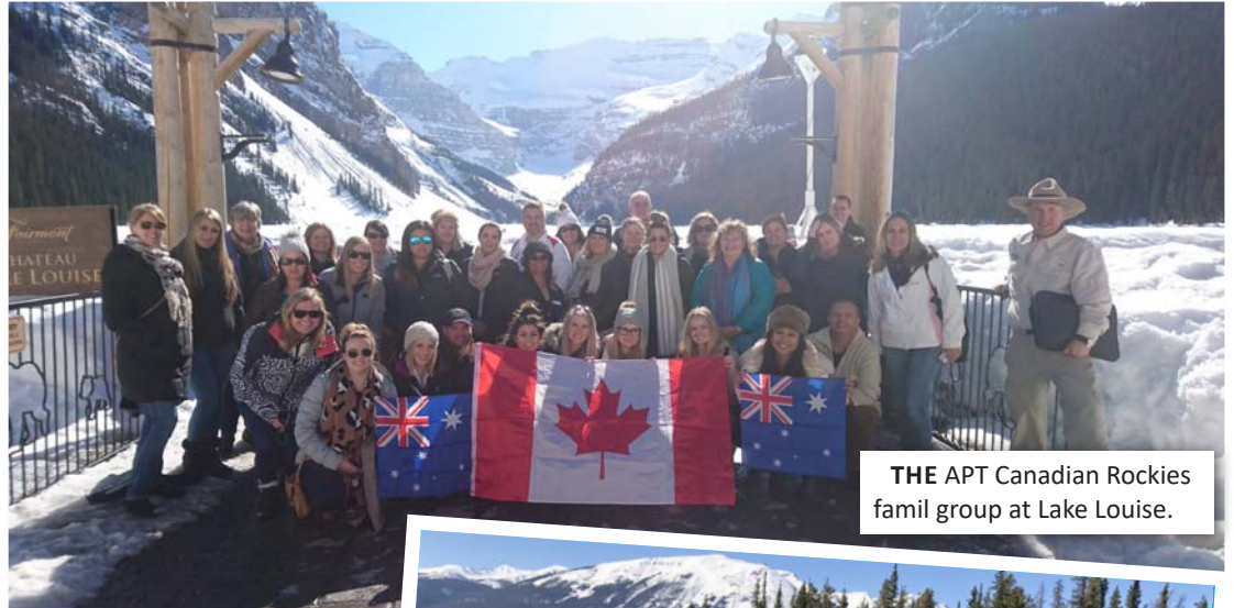
THE APT Canadian Rockies famil group at Lake Louise.

APT also turned up the speed, offering the agents a chance to take