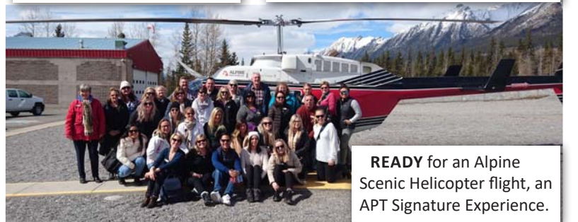
READY for an Alpine Scenic Helicopter flight, an APT Signature Experience.