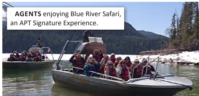
AGENTS enjoying Blue River Safari, an APT Signature Experience.