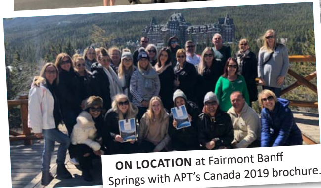
ON LOCATION at Fairmont Banff Springs with APT's Canada 2019 brochure.