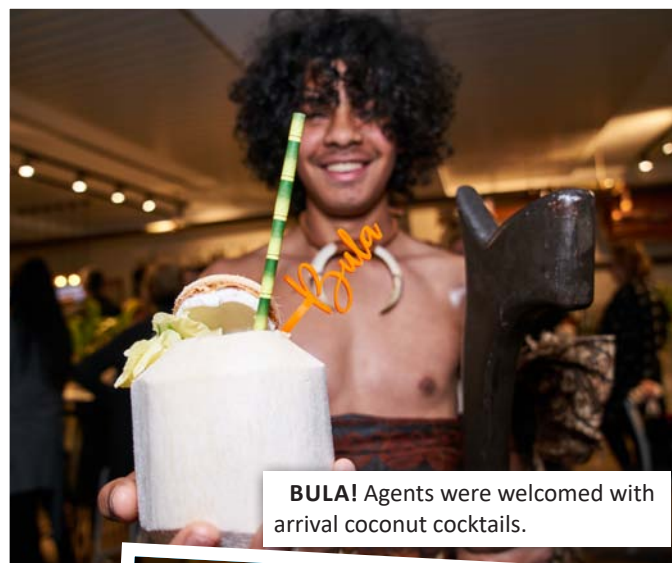
BULA! Agents were welcomed with arrival coconut cocktails.

Visit engage.exciteholidays.com/fiji for more information and to download the curated guide.