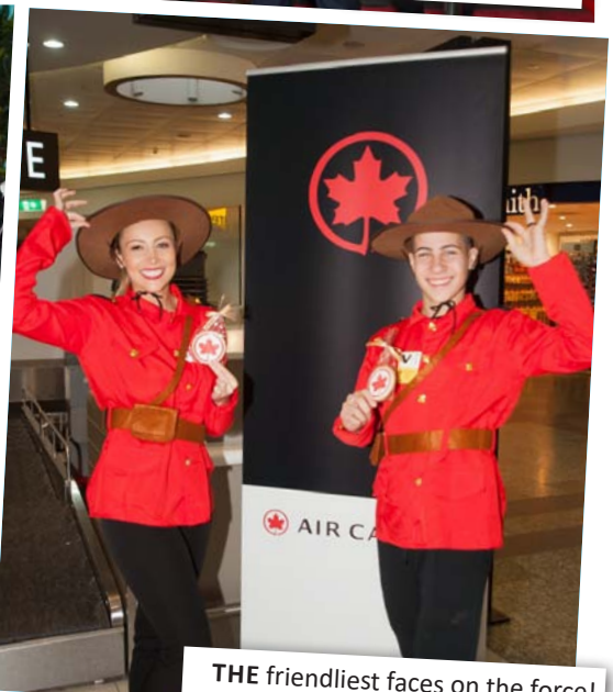
THE friendliest faces on the force!