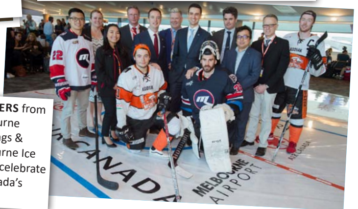
PLAYERS from Melbourne Mustangs & Melbourne Ice helped celebrate Air Canada's launch.