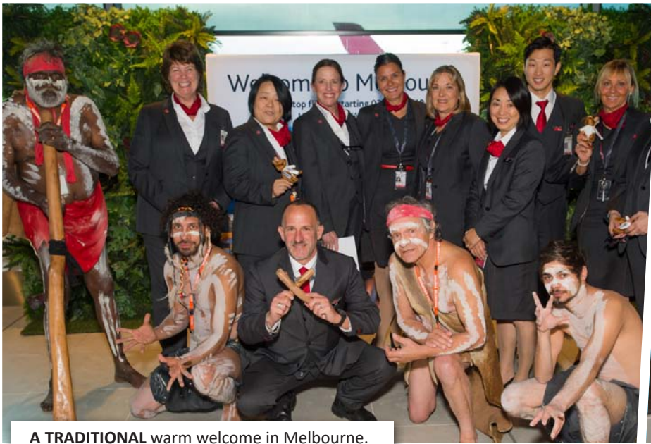
A TRADITIONAL warm welcome in Melbourne.