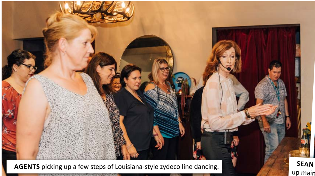
AGENTS picking up a few steps of Louisiana-style zydeco line dancing.