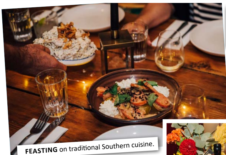
FEASTING on traditional Southern cuisine.