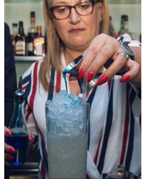
LA THEMED cocktail - The Surfrider.