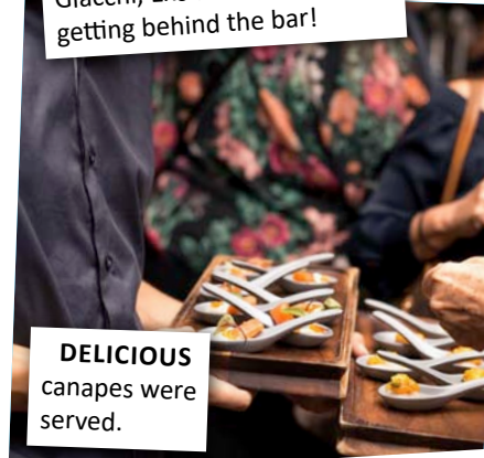
DELICIOUS canapes were served.