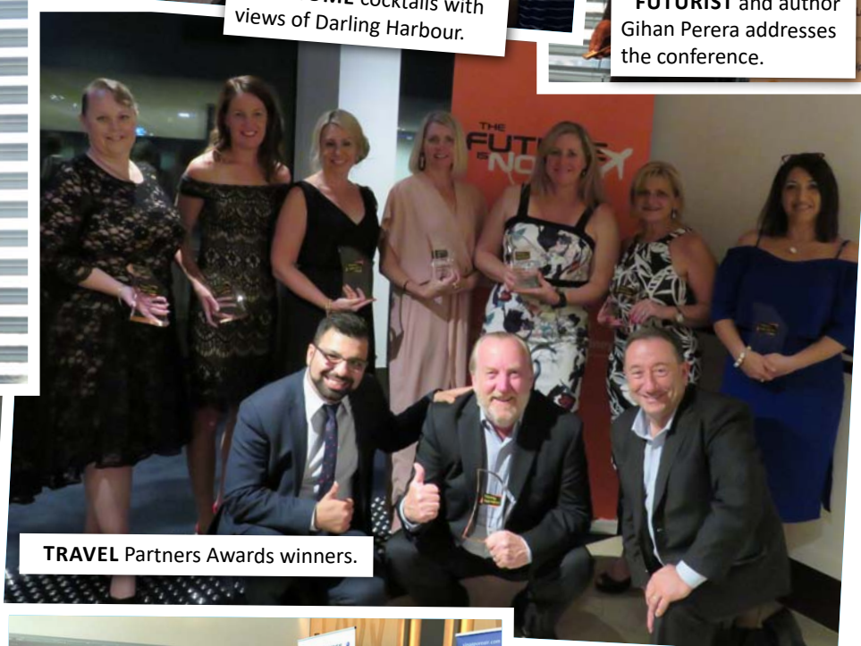
TRAVEL Partners Awards winners.