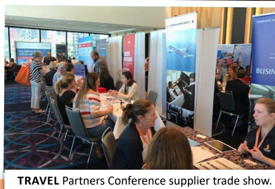
TRAVEL Partners Conference supplier trade show.