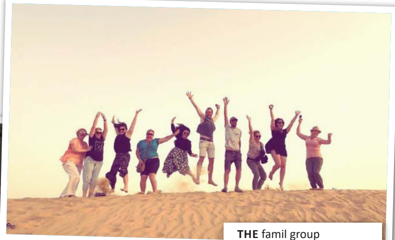
THE famil group discovering Abu Dhabi's desert landscape on safari.