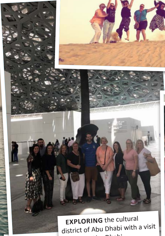
EXPLORING the cultural district of Abu Dhabi with a visit to Louvre Abu Dhabi.