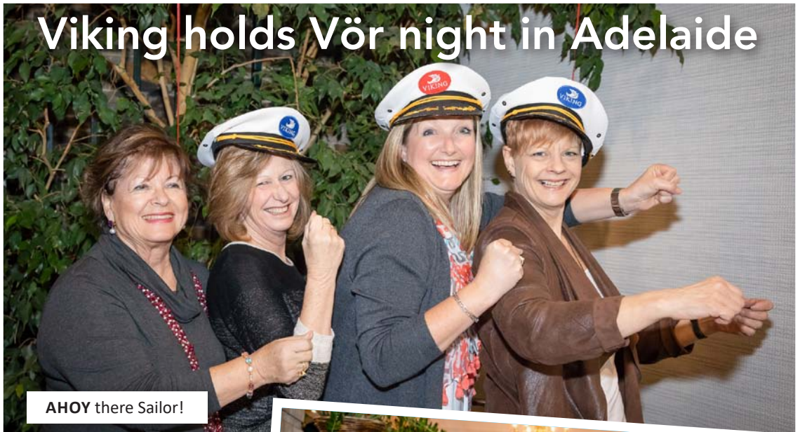
AHOY there Sailor!

MORE than 120 agents attended Viking's Vör training night in Adelaide on Wed night, where they learnt about Viking over a two-course meal & drinks.