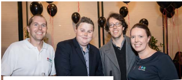
THE Holidays of Australia team.