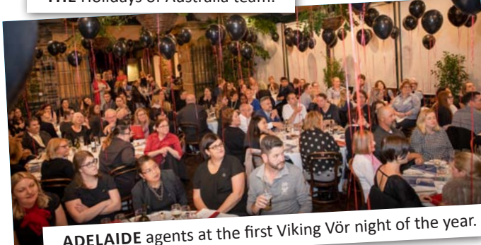
ADELAIDE agents at the first Viking Vör night of the year.