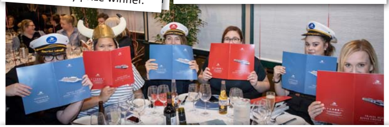
AGENTS discover the Viking difference in the new agent training manuals.