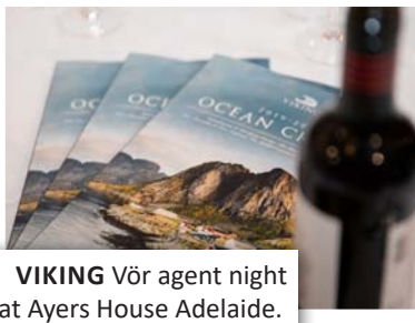
VIKING Vör agent night at Ayers House Adelaide.