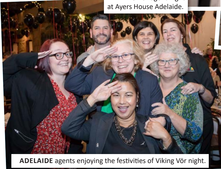
ADELAIDE agents enjoying the festivities of Viking Vör night.