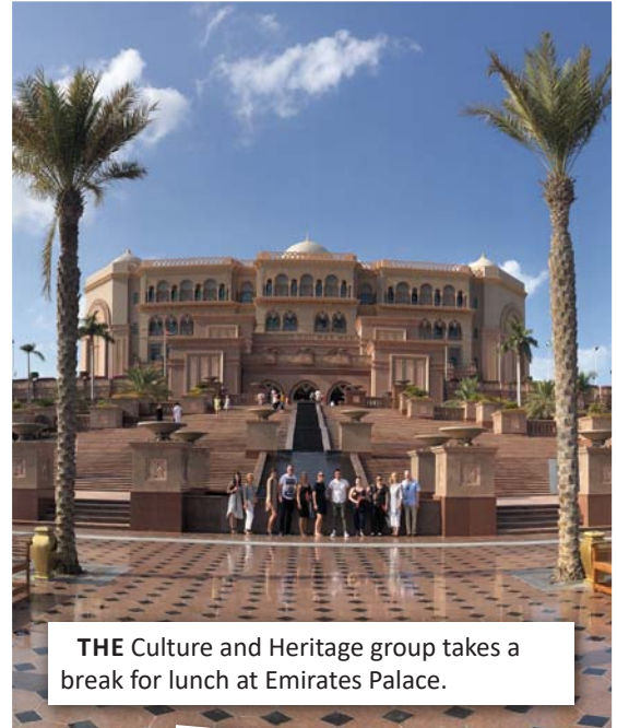
THE Culture and Heritage group takes a break for lunch at Emirates Palace.