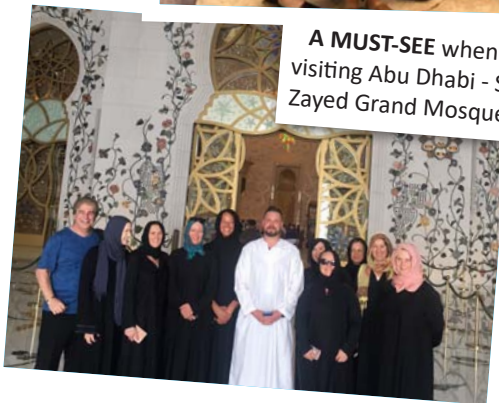
A MUST-SEE when visiting Abu Dhabi - Sheikh Zayed Grand Mosque.