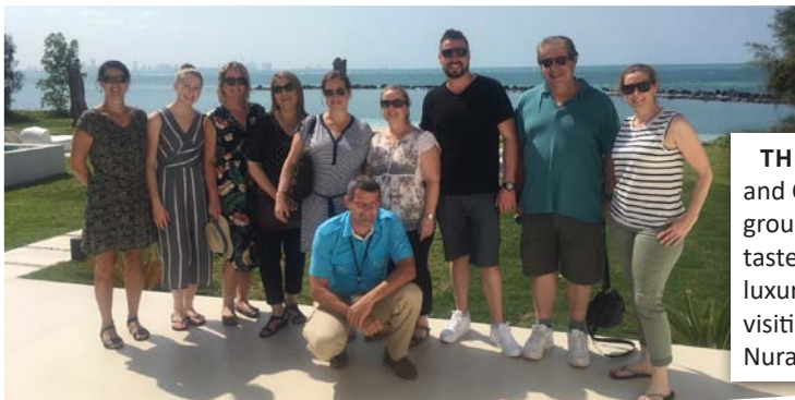
THE Culinary and Creative group gets a taste of ultimate luxury while visiting Zaya Nurai Island.