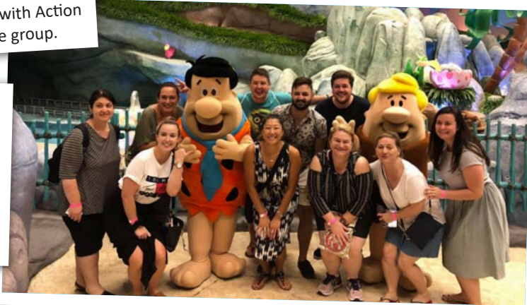
FRED and Barney join the Action & Adventure group at Warner Bros. World Abu Dhabi.