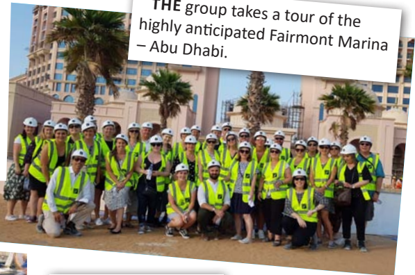
THE group takes a tour of the highly anticipated Fairmont Marina – Abu Dhabi.