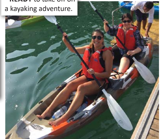
READY to take off on a kayaking adventure.