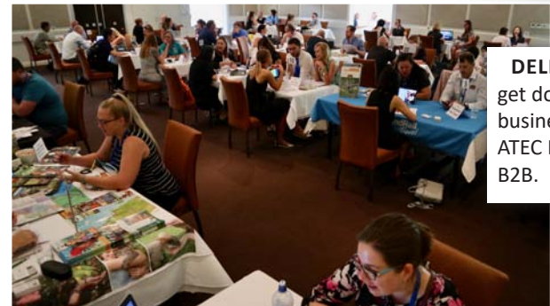
DELEGATES get down to business at the ATEC IUN2018 B2B.