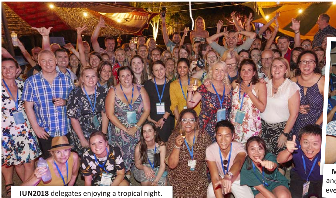
IUN2018 delegates enjoying a tropical night.