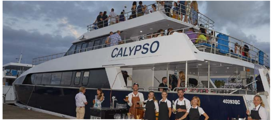
DELEGATES are welcomed aboard Calypso .

Team Sea Turtle took out this year's Instagram competition before all were farewelled by an event hosted by Wildlife Habitat Port Douglas.