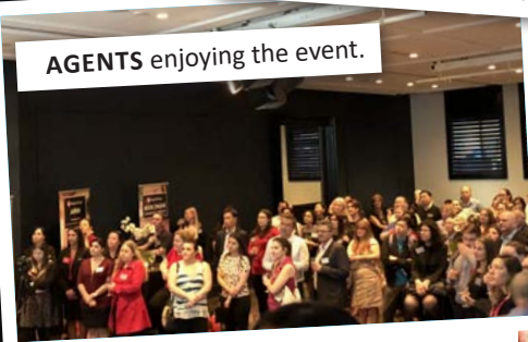
AGENTS enjoying the event.