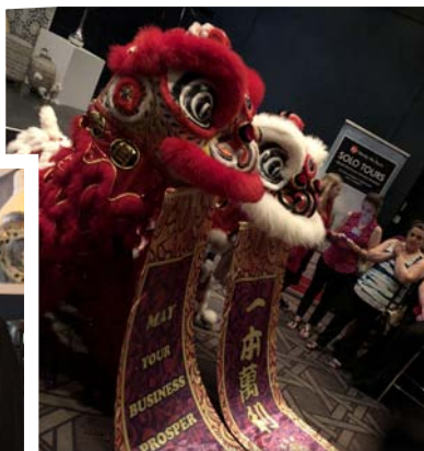
ENCOURAGING messages of prosperity were a key feature.