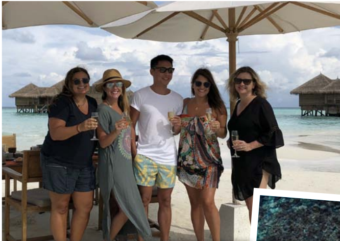
A SPECIAL Champagne breakfast set up in the middle of a sandbar at Gili Lankanfushi.

For Maldives bookings and enquiries, see www.addictedtomaldives.com .