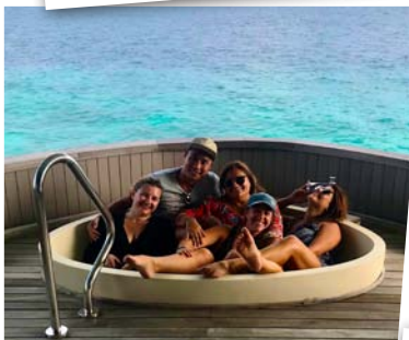
THE token Addicted to Maldives bath tub shot at the St Regis Vommuli Spa.