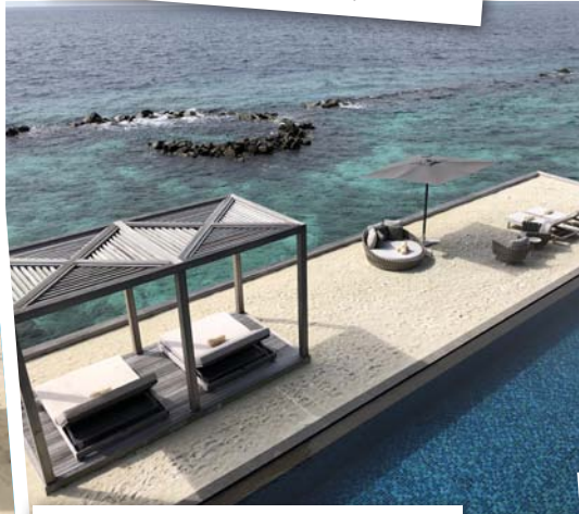
CHECKING out the largest overwater villa - The John Jacob Estate at St Regis Vommuli.