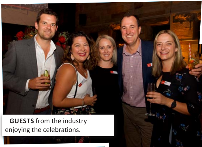
GUESTS from the industry enjoying the celebrations.