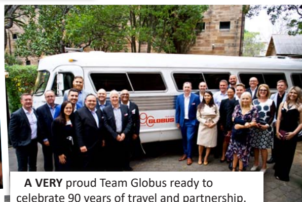
A VERY proud Team Globus ready to celebrate 90 years of travel and partnership.