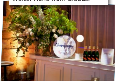
FRENCH champagne and an array of desserts were served to guests.