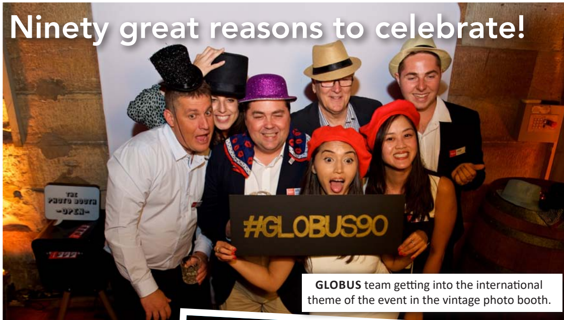
GLOBUS team getting into the international theme of the event in the vintage photo booth.