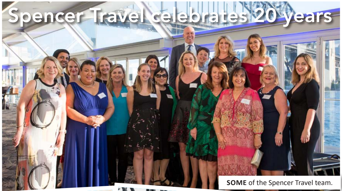
SOME of the Spencer Travel team.

The views over Sydney Harbour were spectacular, with the evening commemorating the many awards achieved by the company and its staff, Spencer Travel's uncompromising commitment to service excellence and its extraordinary growth since being established in 1998.