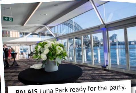
PALAIS Luna Park ready for the party.