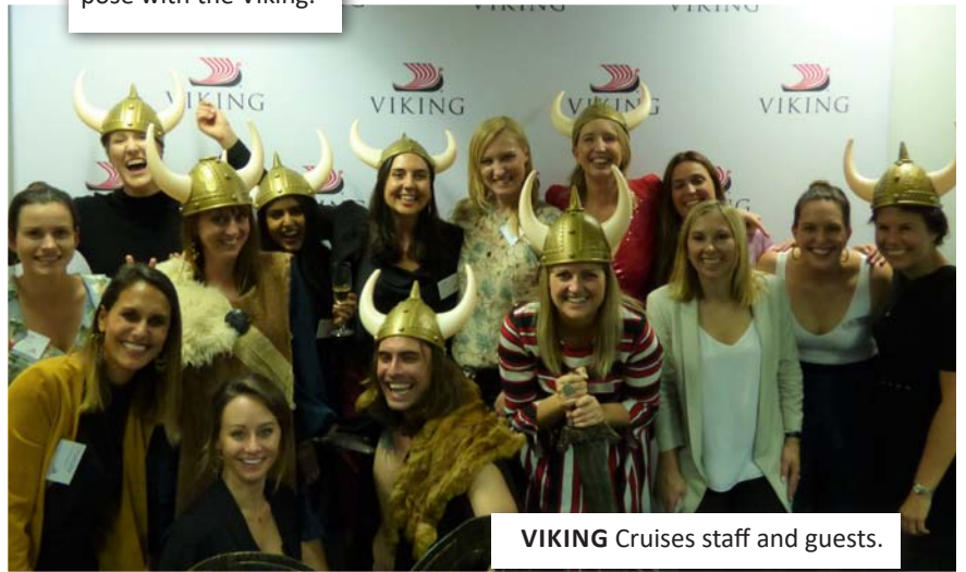
VIKING Cruises staff and guests.