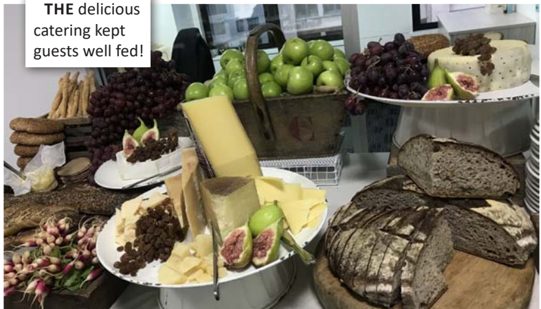
THE delicious catering kept guests well fed!