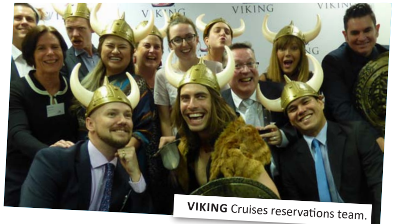
VIKING Cruises reservations team.