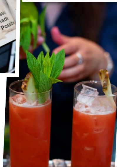
THE famous Singapore Sling was a fitting way to welcome all in attendance.