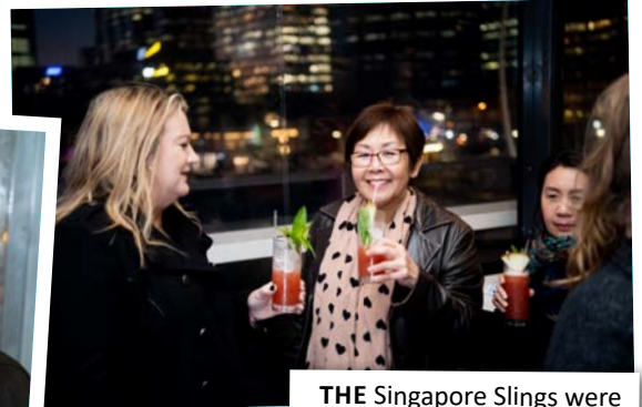
THE Singapore Slings were definitely a talking point.