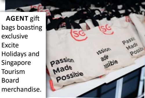
AGENT gift bags boasting exclusive Excite Holidays and Singapore Tourism Board merchandise.