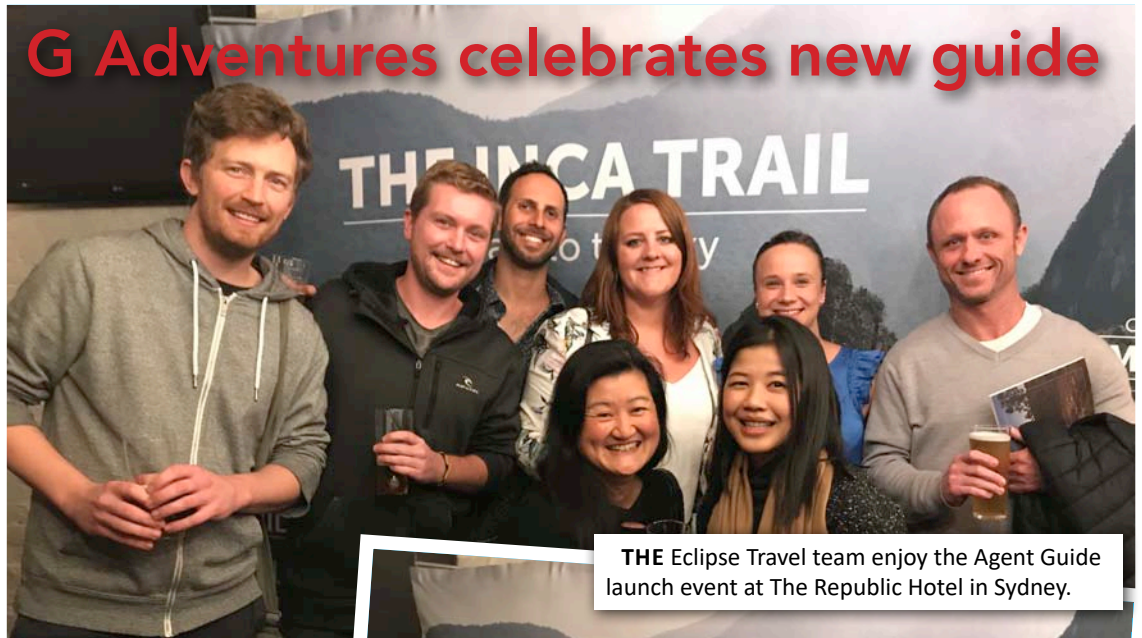
THE Eclipse Travel team enjoy the Agent Guide launch event at The Republic Hotel in Sydney.

Four attendees also won a place on 2019 G Adventures international famil trips.